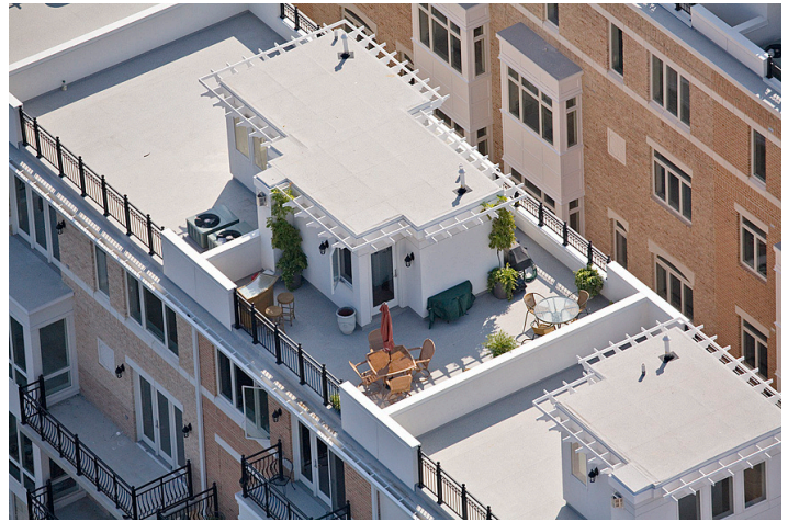
Whether private or semi-private, rooftop decks offer a space of tranquility that many city dwellers long for.

other surface) use of a de-icing agent is perfectly acceptable, requiring only to be rinsed off before the spring sunshine causes it to bake into the vinyl surface. Even if the home's deck is not over living space, Duradek protects the area below and creates instant dry outdoor storage.