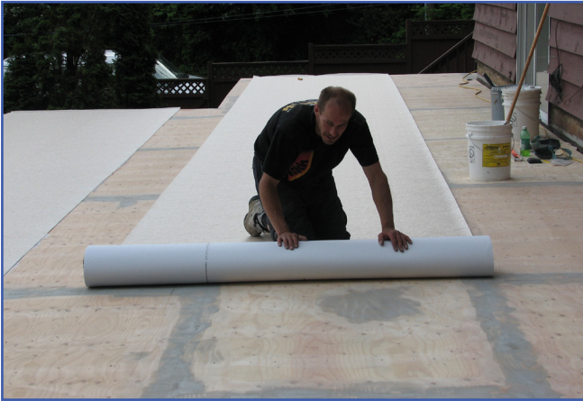
The Duradek membrane is carefully rolled out onto the prepared surface.