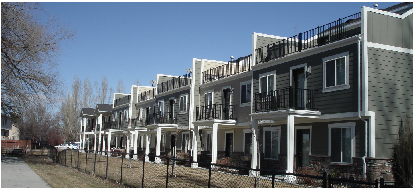
The Rivercrossing Townhome Community is setting a new standard in Utah for maximizing living space and enhancing quality of life.

In some cities, like New York or Baltimore, residents have already embraced the value of roof top decks, and the benefit of water and skyline