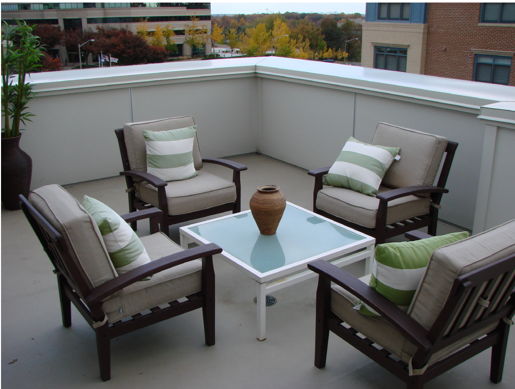
Your newly created outdoor living space can easily be transformed into a low-maintenance outdoor entertaining area.

David states, "it will always be in demand." The Rivercrossing Townhome Community has set a new trend for quality and standard in the industry and those that were fortunate enough to purchase in this community are able to enjoy barbecues, patio sets and even hot tubs on their semi-private roof top decks.