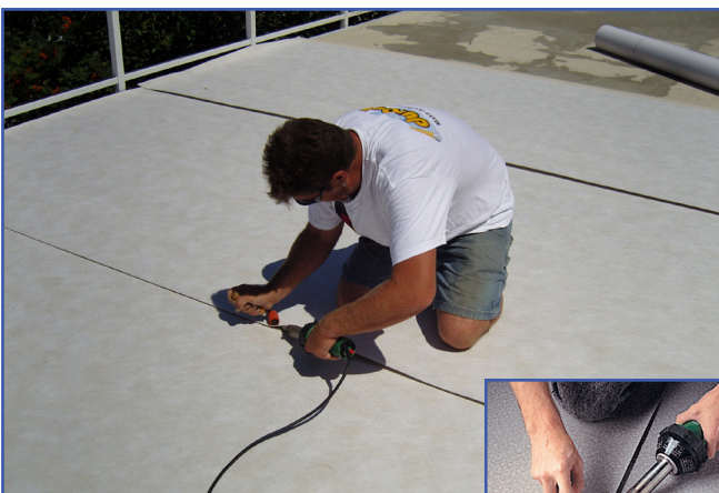
Trained applicators hot-air weld the overlapped seams for impenetrable protection.