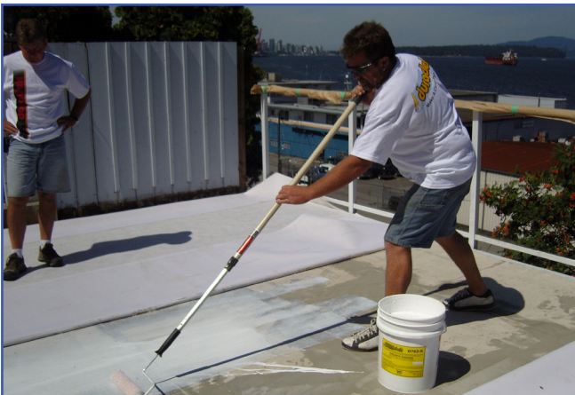
The membrane is fully adhered to the substrate.