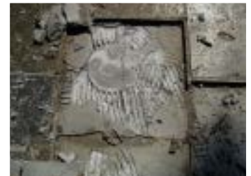
Thinset Coverage Should be 100%

Obviously the skill of the tile setter is extremely important to the eventual success of the job. There are a few installation issues we saw that play a major role in the success of an outdoor tile job.