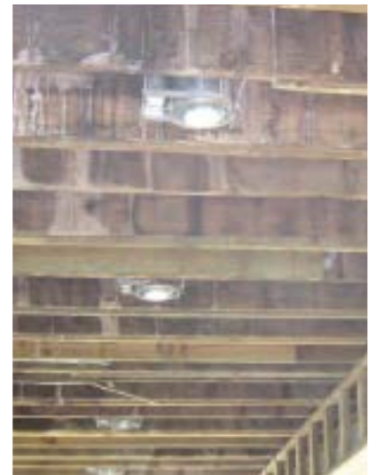
Failed Tile Job

Our theory is this: the tile assembly is expensive, but a popped tile or cracked grout joint is relatively easy to repair.