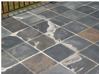
Efflorescence on Tile

Efflorescence: The white stains that seem to ooze out of the grout joints or from the outer edge of the tiled surface might be a result of