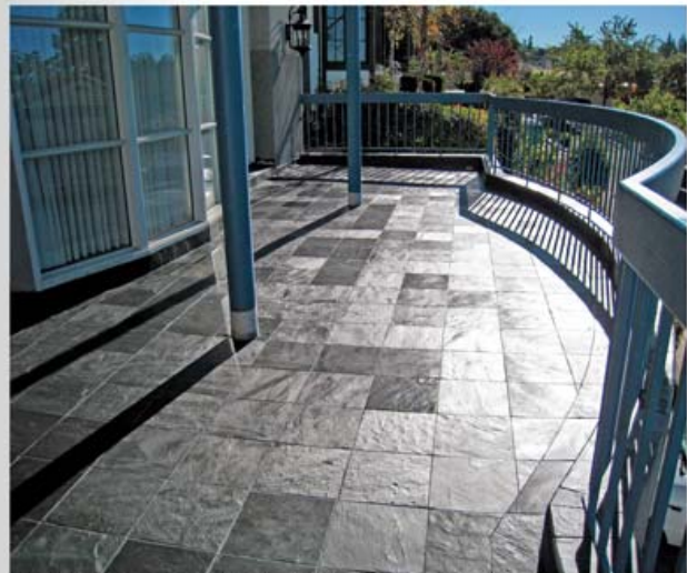
Finished tile deck, using Duradek Ultra Tiledek as the waterproof membrane.