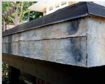
Thin-set coverage should be 100%.

that are part of the thin-set bonding adhesives?