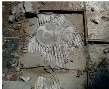
Efflorescence can result from a poor choice of grout or thin-set mortar.

are obviously susceptible to dramatic temperature and humidity fluctuations. Some very experienced tile setters won't do an outdoor job unless it can be tarped off to keep it out of the direct sun and rain for a significant period of time to allow for the proper curing of the materials. There are fast-setting