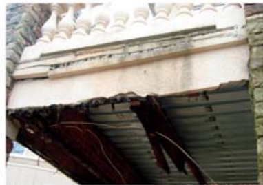
Tile failure resulting from a poor choice of waterproofing membrane.

There are many manufacturers who offer waterproofing products that are suitable under tile. There are only a few that offer roofing materials for this purpose. Our question is this: what is the difference? It is either capable of keeping the water out or it isn't. You can't be "almost" water-