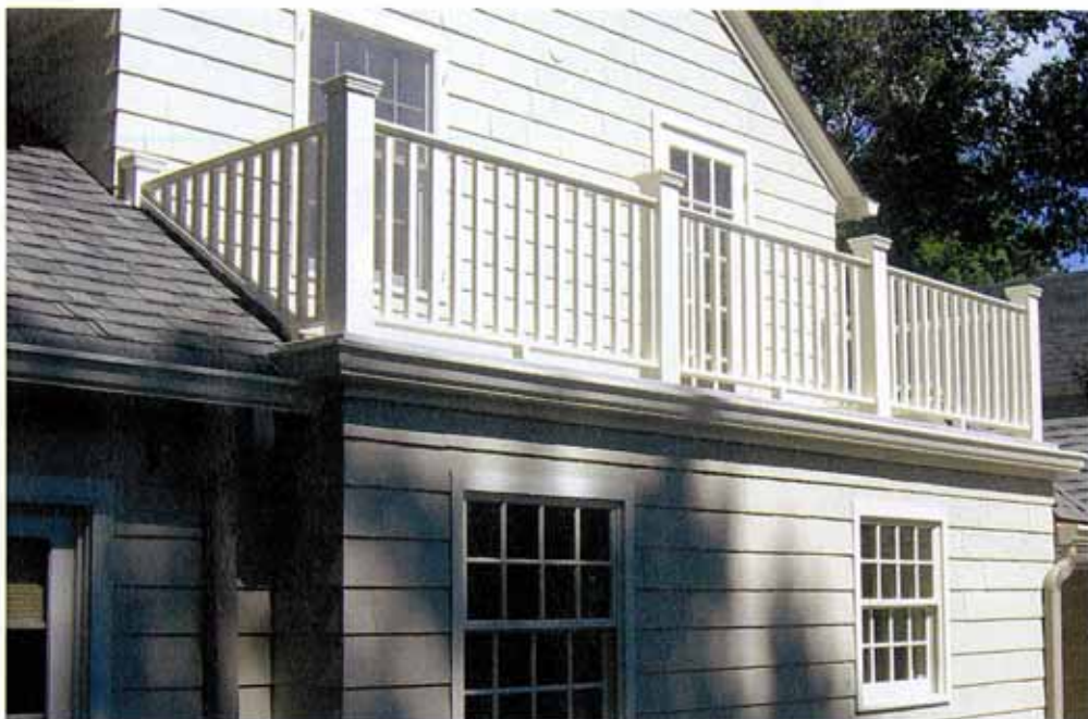
Figure 7. A simple painted cedar railing finishes the deck (left). Balusters are attached with screws through a rail insert at the top (below). A V-shaped notch at the base of each baluster (bottom) matches the beveled top of the shoe rail.