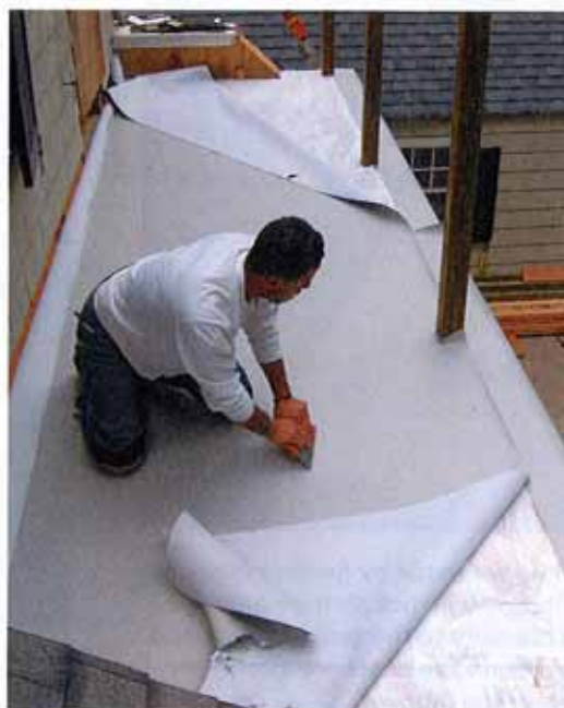
Figure 4. A crew member carefully marks and cuts openings for the rail posts (far left). Then, after gluing down the strip of membrane along the edge of the deck, he glues down the main section of membrane, overlapping the perimeter strip 1 inch (left).