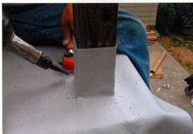
Figure 5. Watertight joints are made by heating overlapping edges of the membrane with hot air from a heat gun and then applying pressure to the seam with a hand roller (top). The collars around the posts are also heat-welded to the deck membrane (above).