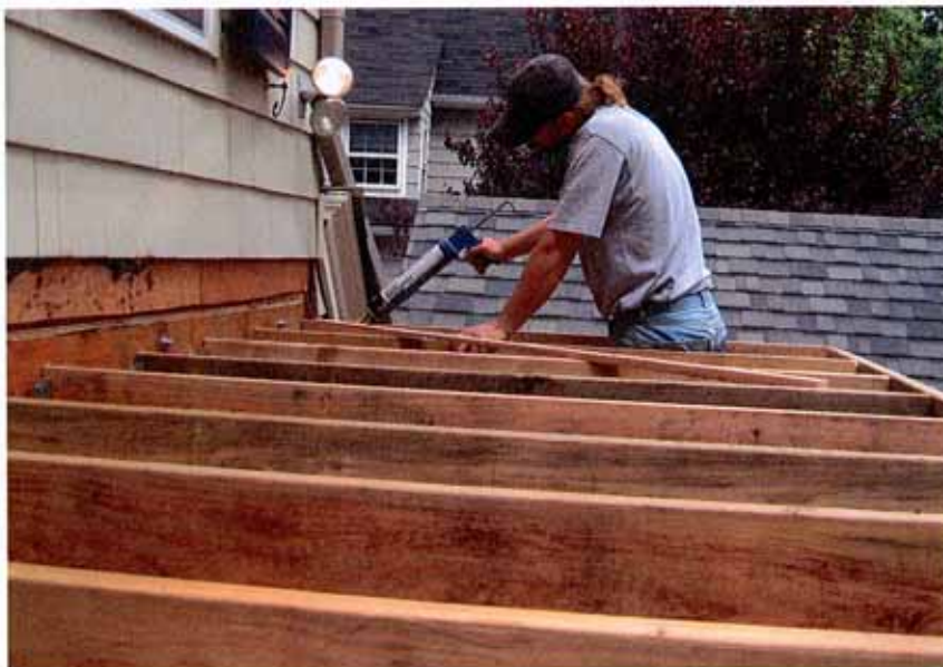
Figure 1. Tapered strips of framing lumber glued and screwed to the deck joists supply the necessary 2 percent slope for drainage (top). Four-by-four PT railing posts are bolted to the framing (right) before the plywood deck sheathing is installed (far right).

Although the PVC membrane itself can be installed only by an authorized Duradek dealer, we needed to construct the deck properly to receive it. For proper