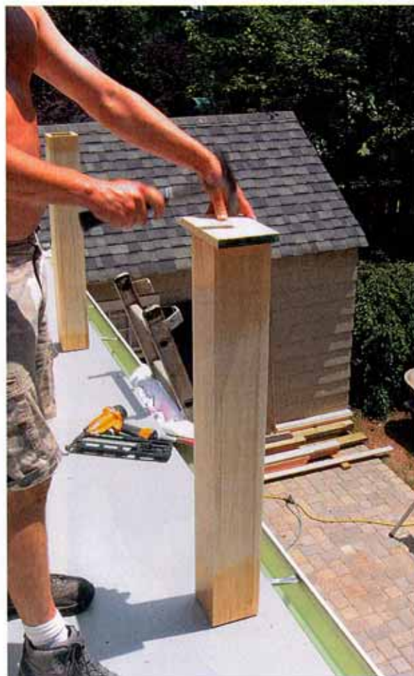
Figure 6. Boxed newels slide down over each post, covering the collar at the bottom.