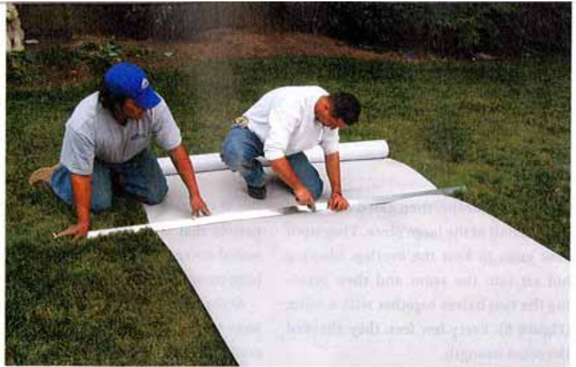
Figure 3. After cutting the first section of membrane to length (right), the installation crew dry-fits it to the deck. Once it's in position, they roll back half the membrane lengthwise (below) and apply adhesive to the exposed part of the deck before laying the membrane back in place (below right).