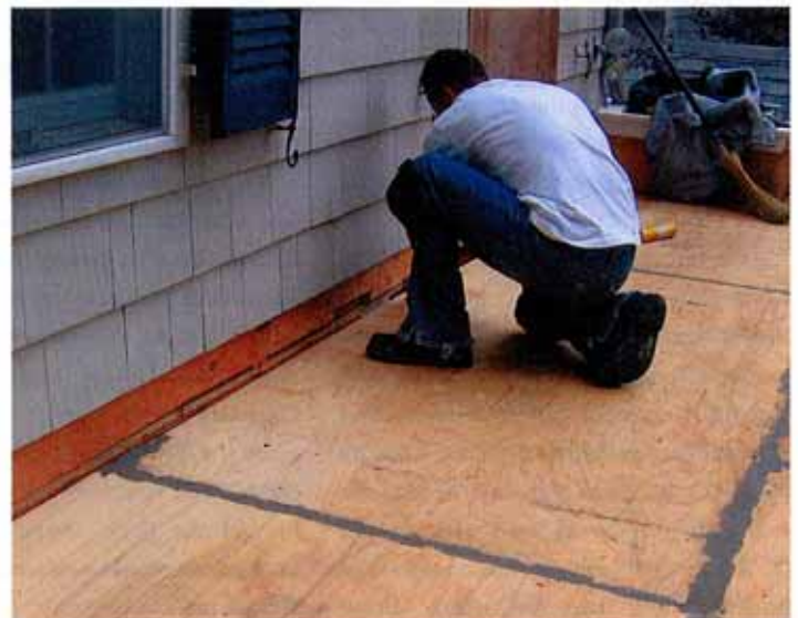
Figure 2. After installing the metal perimeter drip edge, the Duradek installers patch joints, nail heads, and voids in the plywood deck with a silica-based floor filler (above), then sand the deck smooth (above right). Sealant fills the joint between the deck and wall sheathing, preventing the membrane from forming a water-collecting crease (right).