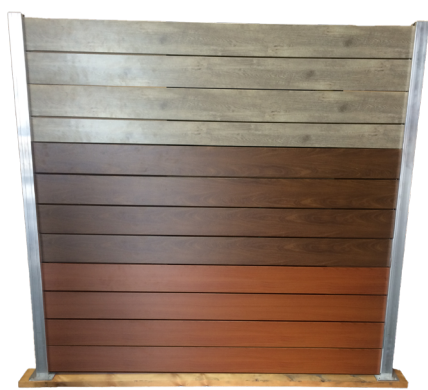
Knotwood PUP Kit example with the 3 available colors