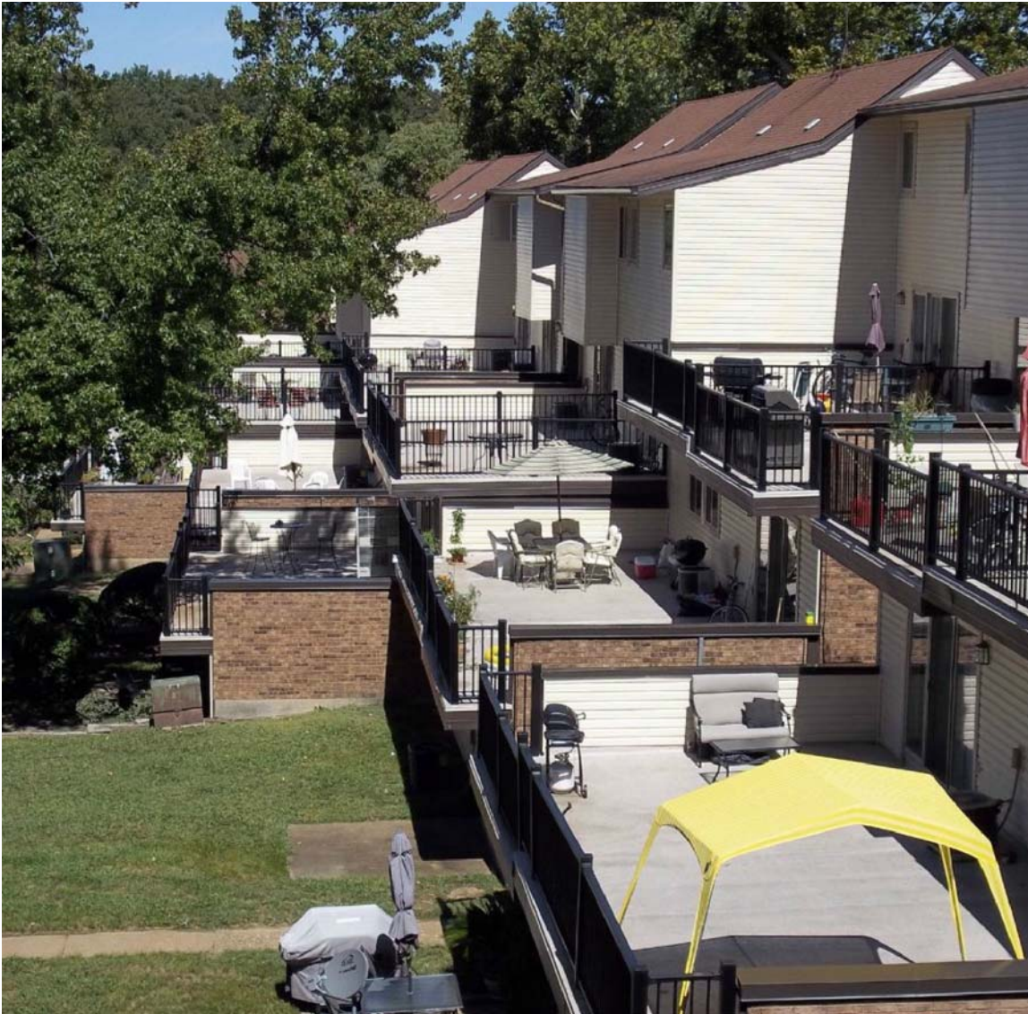
Duradek used its product as a waterproofing membrane for the sun-decks and roof decks of this multiresidential project.